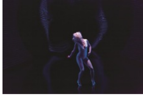
The Pyre